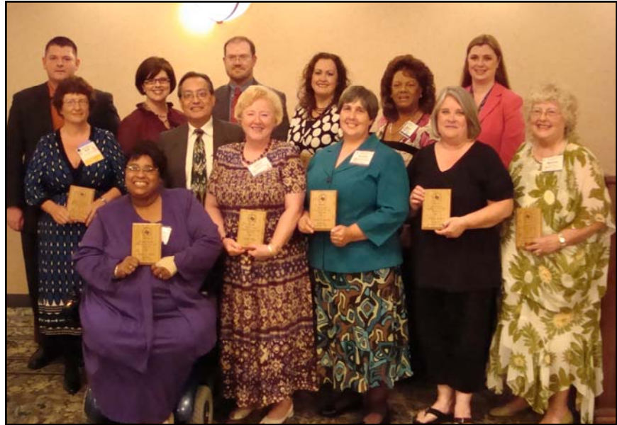
The nominees for Educator of the Year pose for a group picture after the reception in their honor.